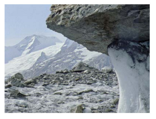
5 Laurence Favre Résistance, 2017 DCP (from 16mm Film), Colour, Sound, 11 Min.