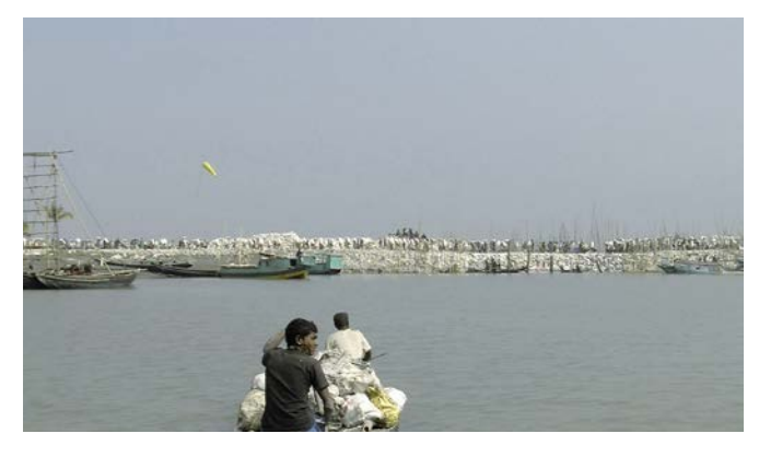
4 Ursula Biemann Deep Weather, 2013 DCP, Colour, Sound, E, 9 Min.